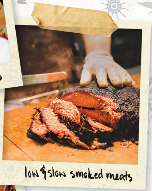
low & slow smoked meats