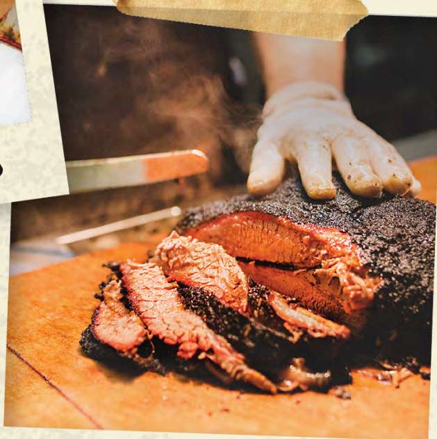
low & slow smoked meats