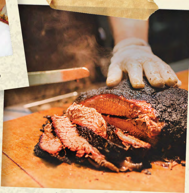
low & slow smoked meats